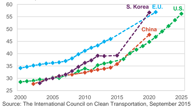
Exhibit 1: Efficiency standards across the world are raising the bar Passenger Car MPGs: Realized Results and Enacted Standards Gasoline equivalent, normalized to CAFE

A decade ago, these standards would have seemed like lofty and maybe even foolish proposals. However, technological advancements are accelerating efficiency gains in new vehicles, making the task of achieving these targets not only possible, but probable. In fact, we believe that regulatory compliance with these new standards is highly likely, especially given the financial penalties to the OEMs if they fall short.