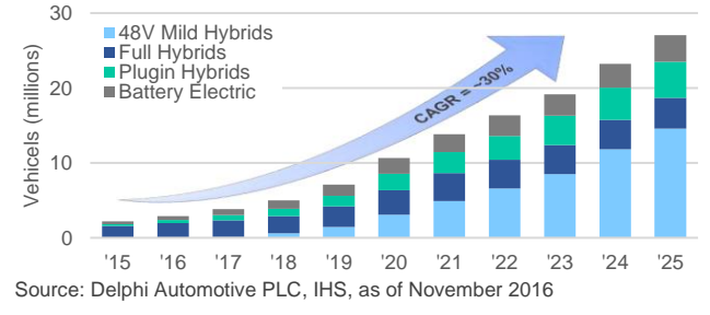
Exhibit 2: Electric vehicles are gaining share at an increasing rate. Electric Vehicle Sales

We believe the increased penetration of technologically advanced products, both those targeting increased ICE efficiency and those incorporated into electric vehicle architectures, should result in demand for these products outpacing production growth over the next five years, as it has for the last five (see Exhibit 3). As a result, the relative appeal of the content providers compared to the OEMs is becoming more pronounced and transforming certain segments of the auto industry from traditionally cyclical groups into attractive secular growth opportunities.